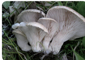
Before Ferulae Mushroom

But they have not uniform shapes and cannot be easily cultivated in jar production way. Fortunately we have succeeded in commercializing of that new ferulae mushroom(mushmaru) through advanced techniques.