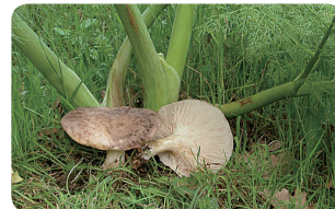
After Mushmaru Mushroom